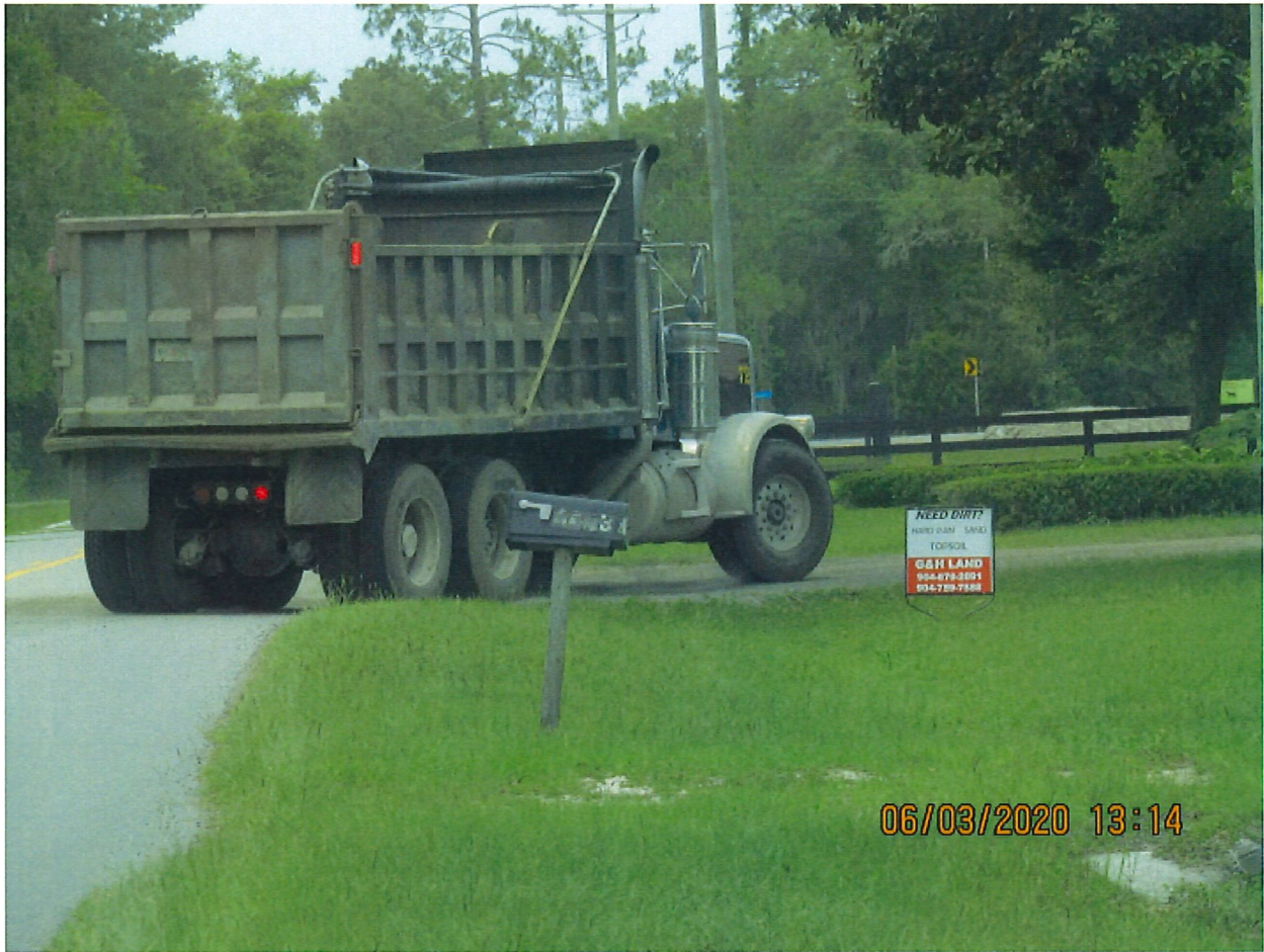
Sandy Ford Road 44230 Complaint # 005073 No Permit / Still Hauling after engineer stop work order 06.03.2020 RB (1)