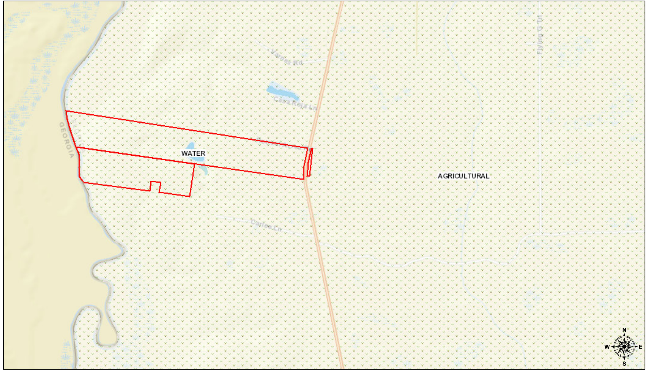
March 19, 2021