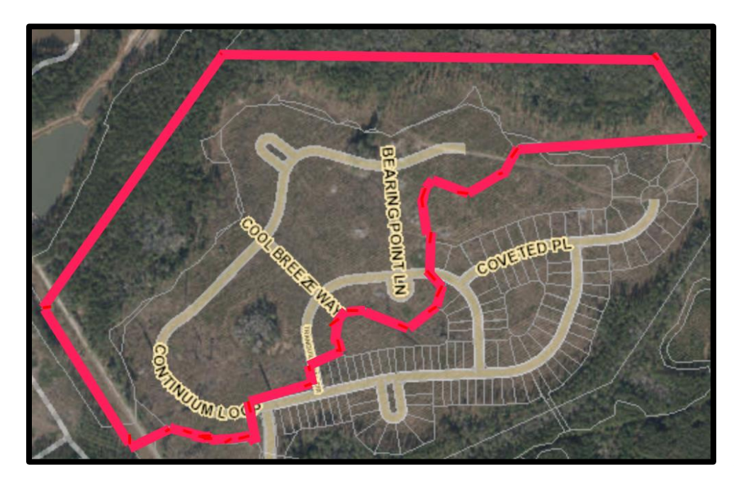
Figure 1: Location map

Del Webb Wildlight Phase 2B, the western half of Parcel 7A, is being platted as the second phase of an age-restricted community planned for several parcels within PDP 3, the third Preliminary Development Plan within the first Detailed Specific Area Plan of the East Nassau Community Planning Area (ENCPA). Located north of the extension of Curiosity Avenue and Del Webb Phase 1, the 70 acre Phase 2B will consist of 139 single family lots, preserved wetlands and several pocket parks. Multi-use trails will connect the subdivision to other areas within the Wildlight community.