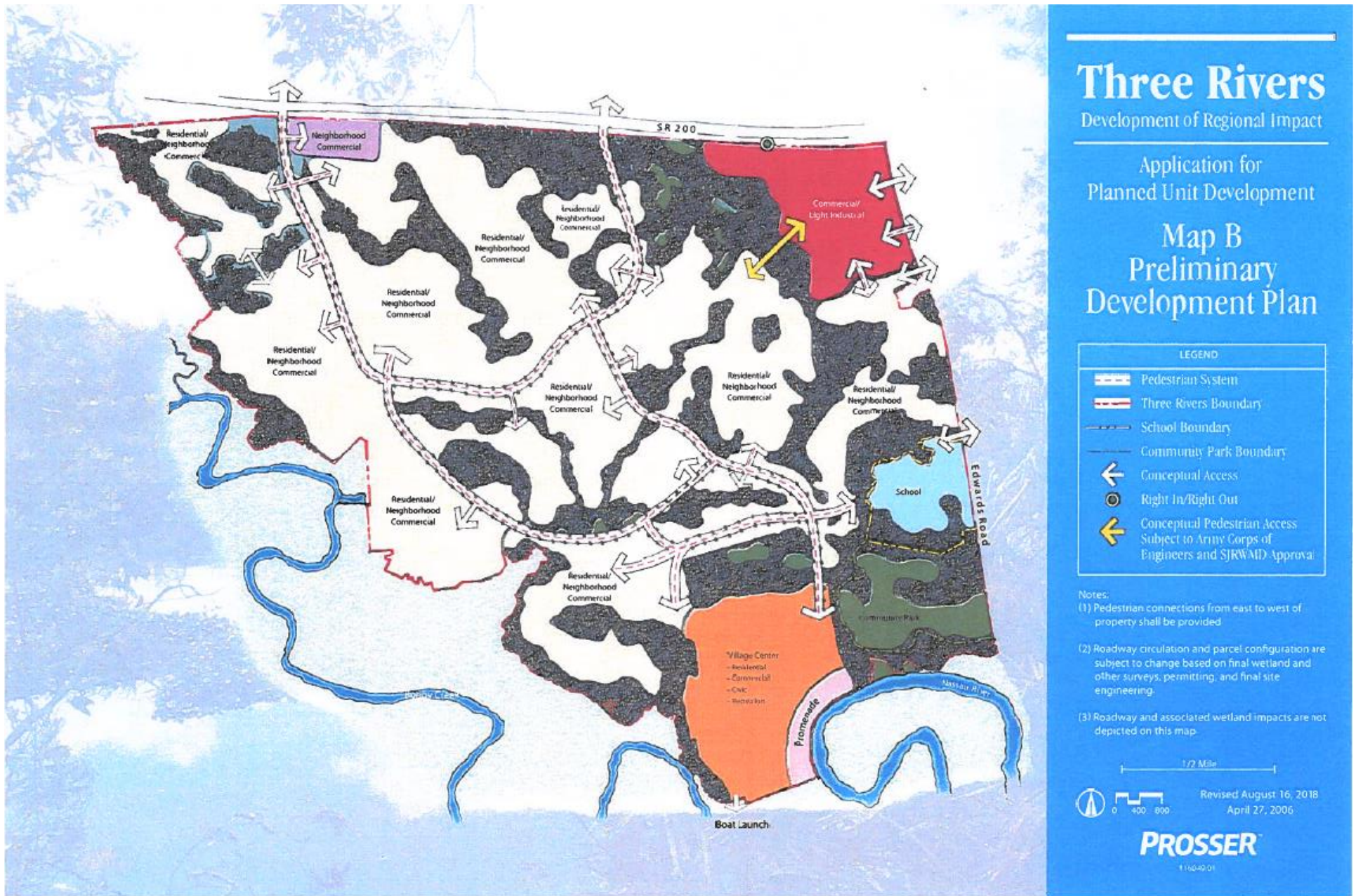
EXHIBIT B- PRELIMINARY DEVELOPMENT PLAN